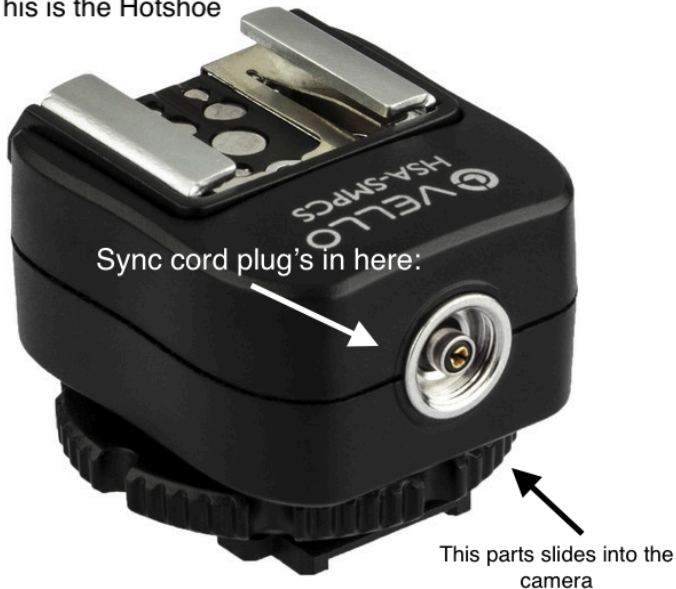
This is the Hotshoe